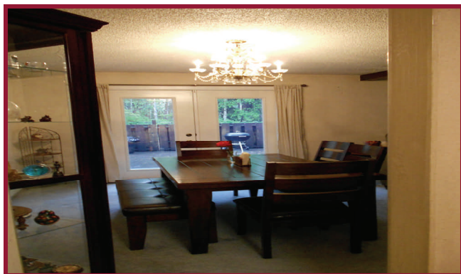
Dining Room View From Kitchen