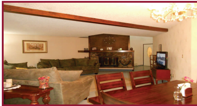
Living Room View from Entry