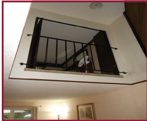
View From 1st Floor Entry