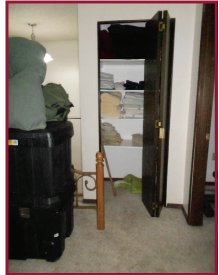
Linen Closet In Hallway