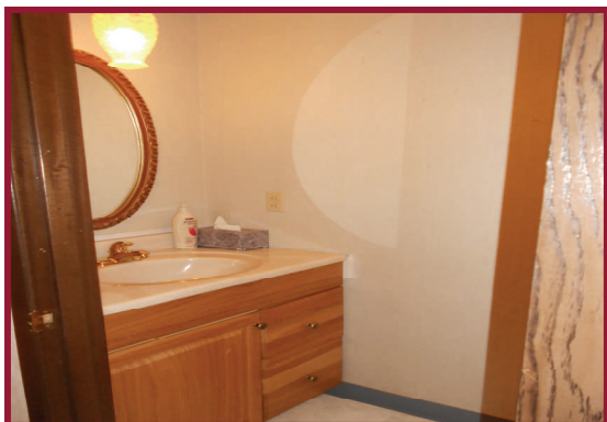
1/2 Bathroom Located On 1st Floor Off Hallway Next To Kitchen