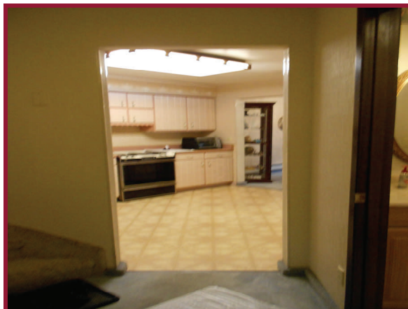
View Of Kitchen From Hallway