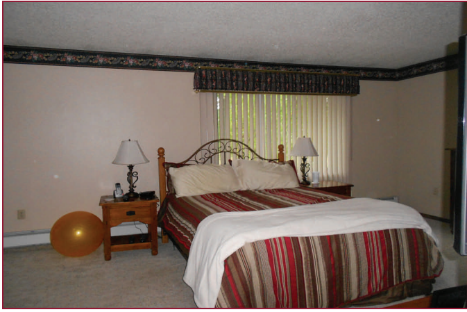
Master Bedroom With Walk in Closet & Master Bathroom