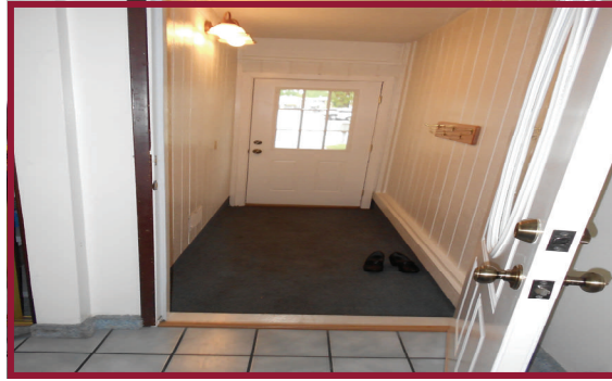
Double Door Arctic Entry