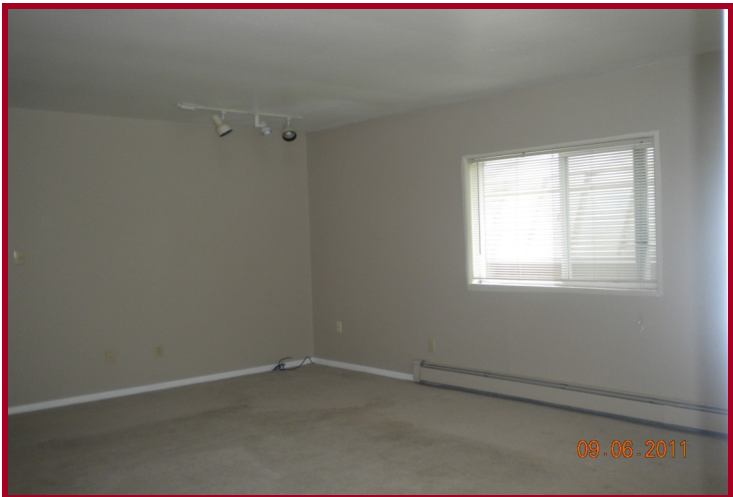
Living Room & Kitchen