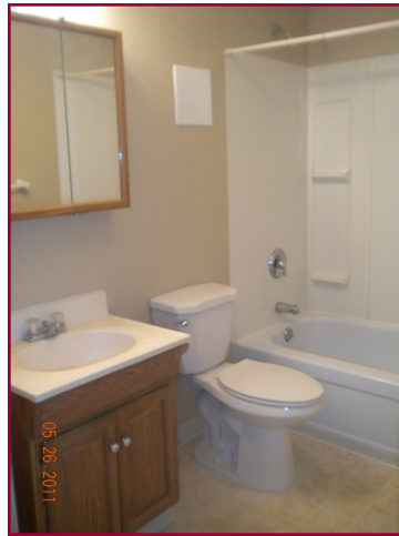
1st Bathroom off of Living Room