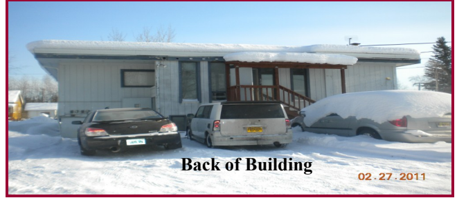
Back of Building