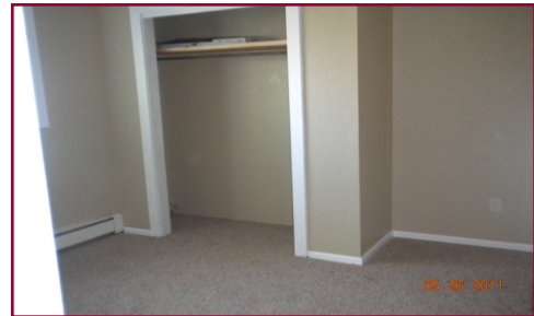
1st Bedroom off of Living Room