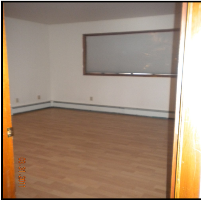
Spacious Master Bedroom With Master Bathroom