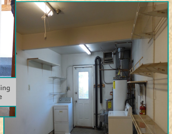
Washer & Dryer in Garage with Entrance to Back Yard