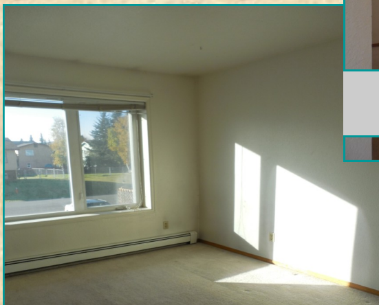
Family Room or Den directly off Bedroom #3 Upper Level Over Garage