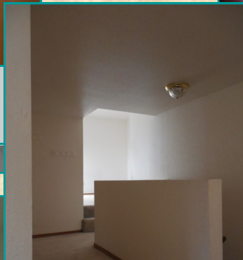
Leads to Bedroom #3