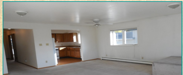
View of Living Room & Kitchen