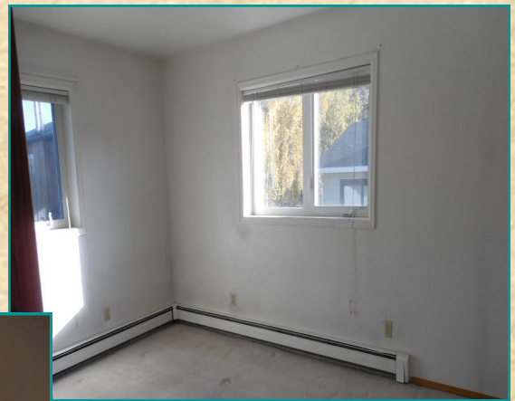
Bedroom #2 Main Level Off Living Room