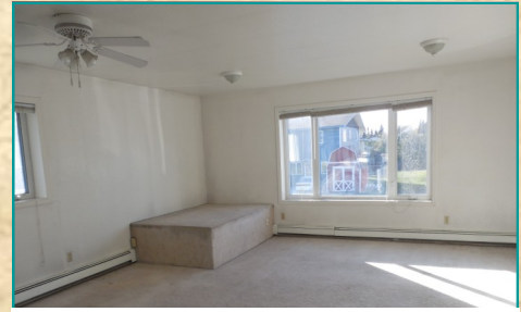
View of Living Room

Includes Heat, Water, & Garbage Tenant Pays Electric