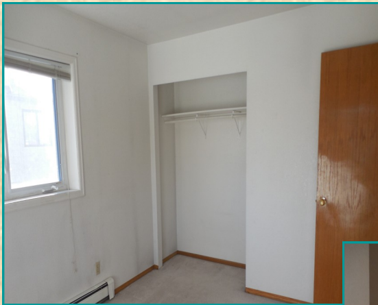
Bedroom #1 Main Level Off Living Room