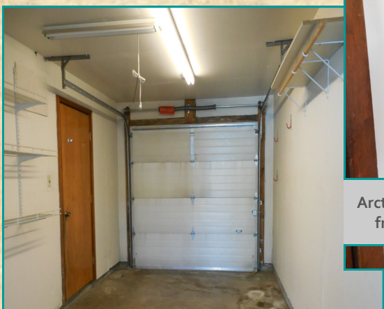
Attached One Car Heated Garage