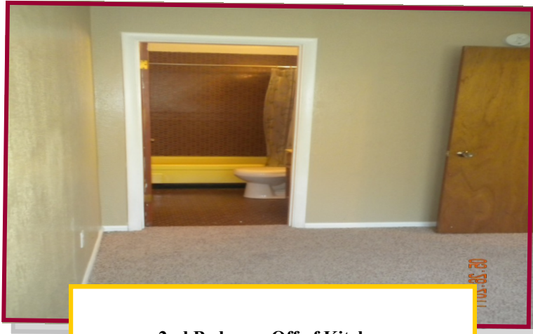
2nd Bedroom Off of Kitchen With 2nd Full Bathroom