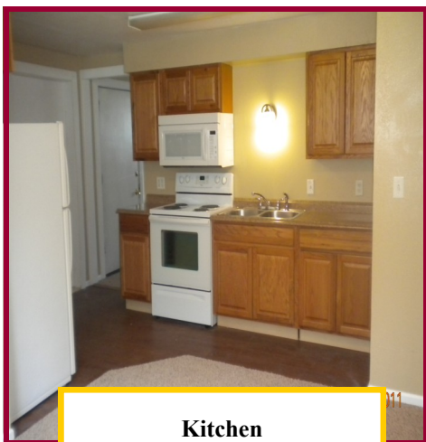
Kitchen View from Dining Area