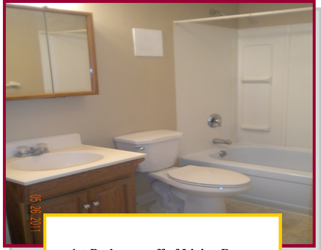
1st Bathroom off of Living Room