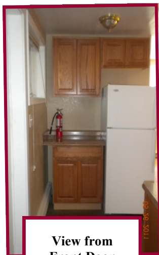
View from Front Door Living Room