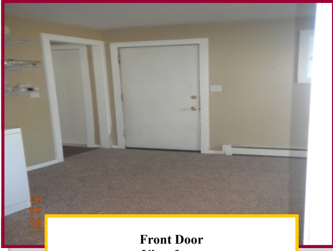
Front Door View from 1st Bathroom Off of Living Room