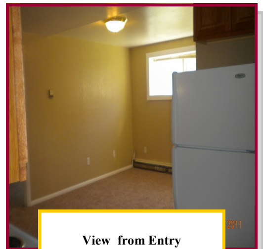
View from Entry Dining Room Area