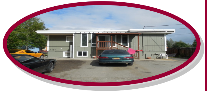
Back of Building

2 Bedroom, 2 Bathroom Apartment Newly Renovated! $1200 per month includes heat, water, and garbage. Tenant to pay Electric $1000 Security Deposit Required Quiet 6 Plex Building-Unit located in Pack 2 parking spaces designated directly out side of unit-Private Alley Entry Unit has washer & dryer in unit! No coin-op!